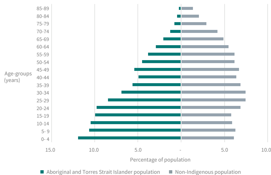
Figure 1. Population pyramid of Aboriginal and Torres Strait Islander and non-Indigenous populations, 30 June 2018

Note: Excludes 90 years and older age-group.